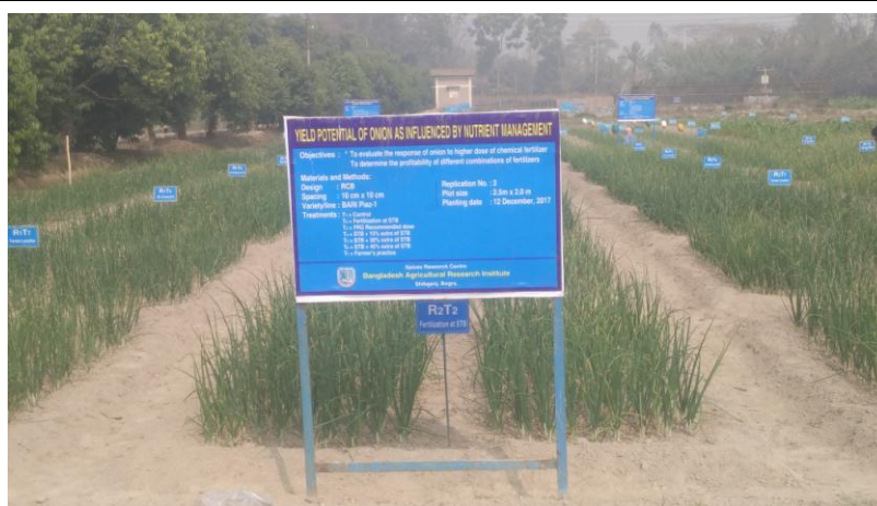
Fig 1. Showing experimental plots

The unit plot size was 3 m x 2.5 m. One-third of N and whole amount of PKSZnB were applied at the time of final land preparation in the form of Urea, Triple super phosphate, muriate of potash, Gypsum, Zinc sulphate and Borax respectively. The remaining 2/3 rd urea were applied in two equal installments during 3 rd and 5 th week after transplanting as top dress.